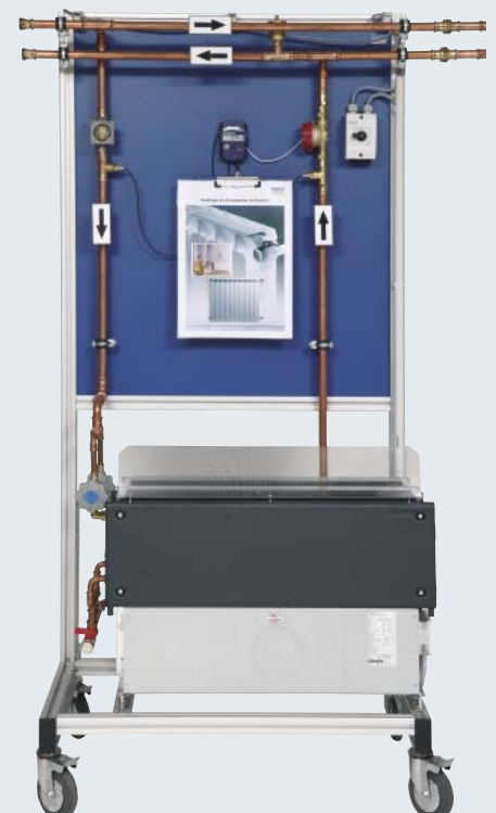
S2 fan convector as the source or the sink