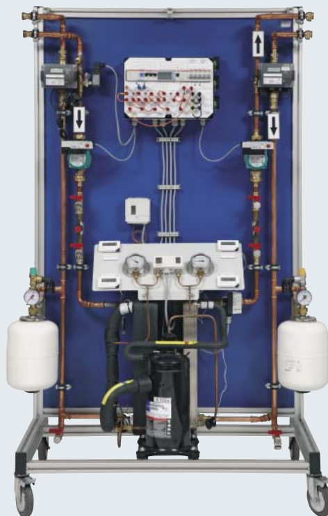
S5 heat pump