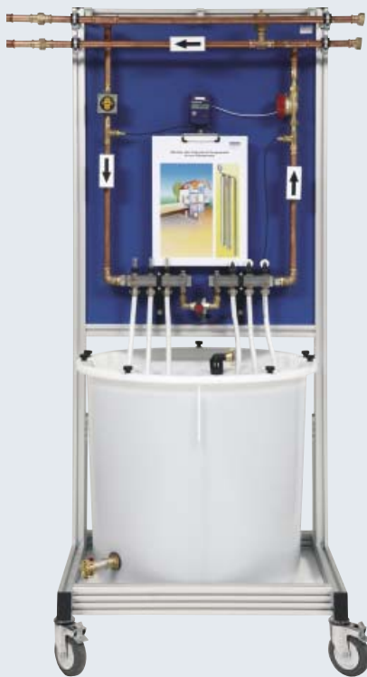
S1 geothermal energy source or floor heating