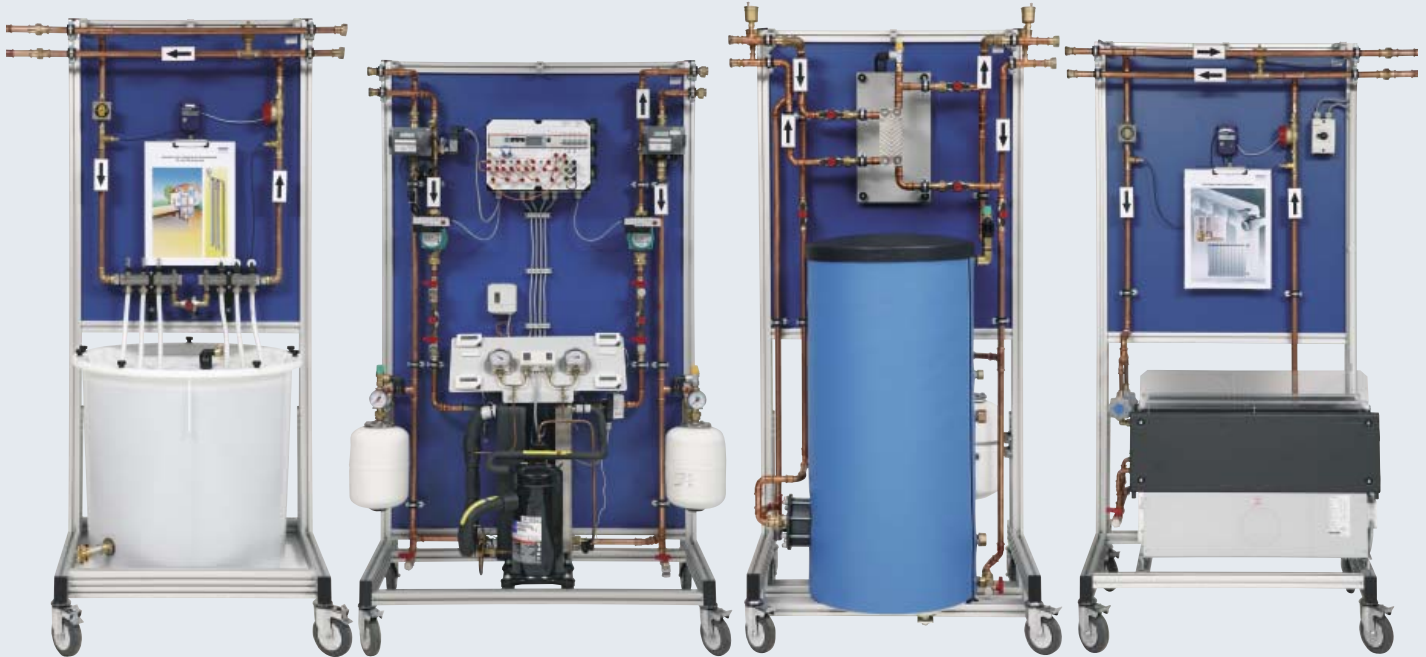
S1 geothermal energy source or floor heating